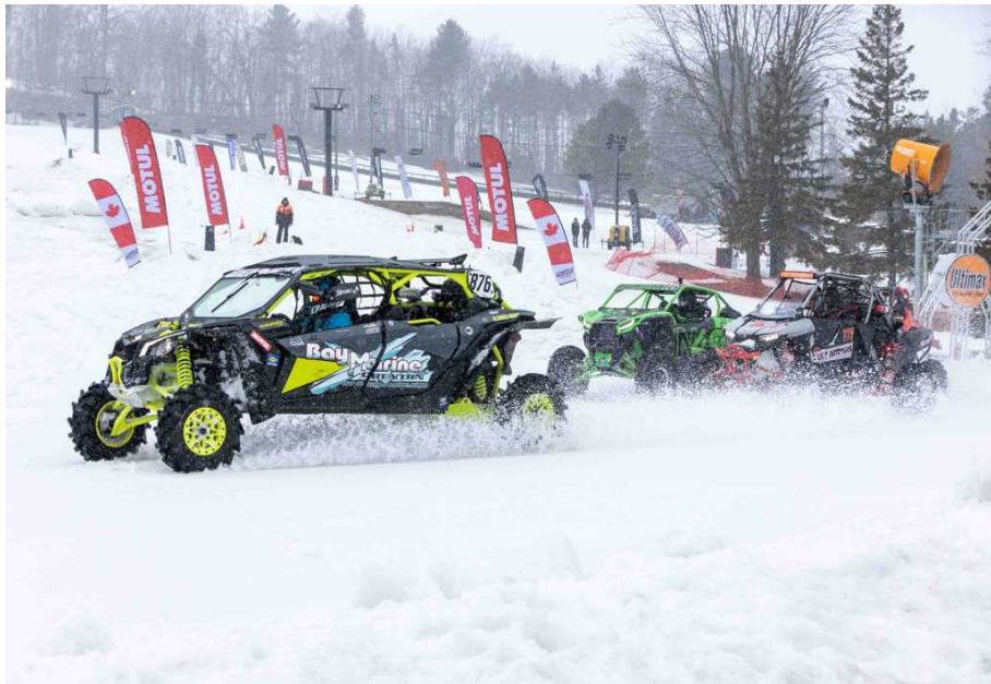
Our CSRA UTV Classes were filled with adrenaline and excitement with the season Championships on the line.