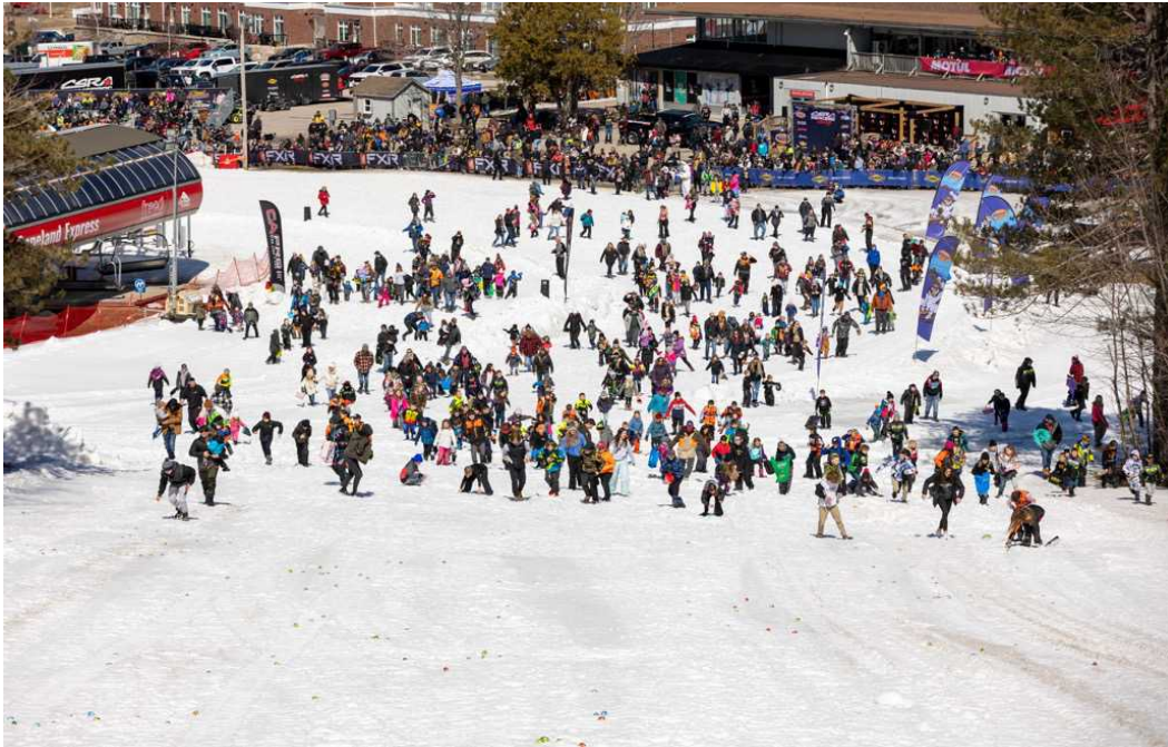
The CSRAs annual kids Easter Egg hunt was once again a “chocolate smashing” good time for all of those who made the mad dash!