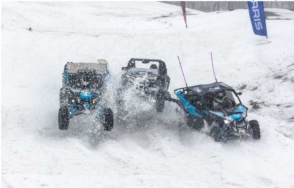
Racing the ski hills of Horseshoe Resort made for some series battles and crazy close calls!